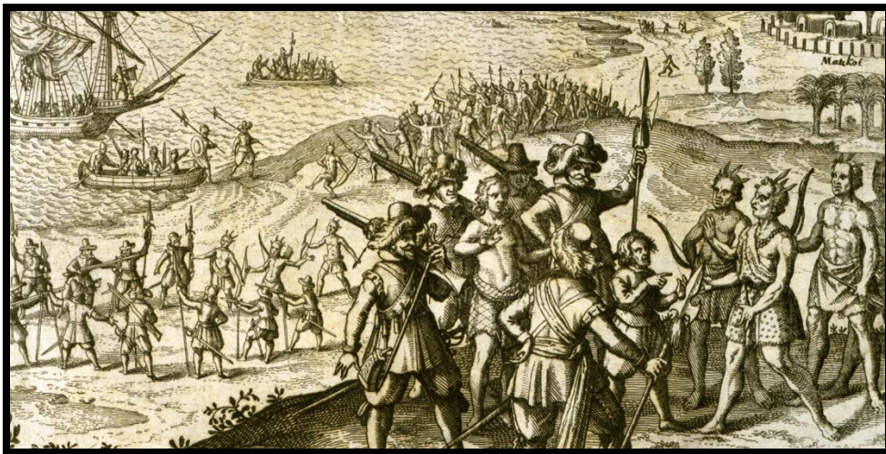
Theodor de Bry, "Negotiating Peace With the Indians," 1634, Virginia